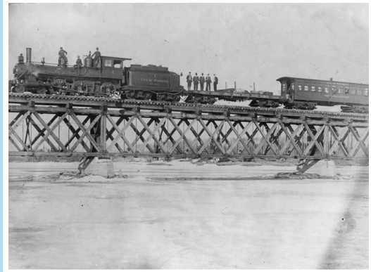
Engine # 1 – 1913