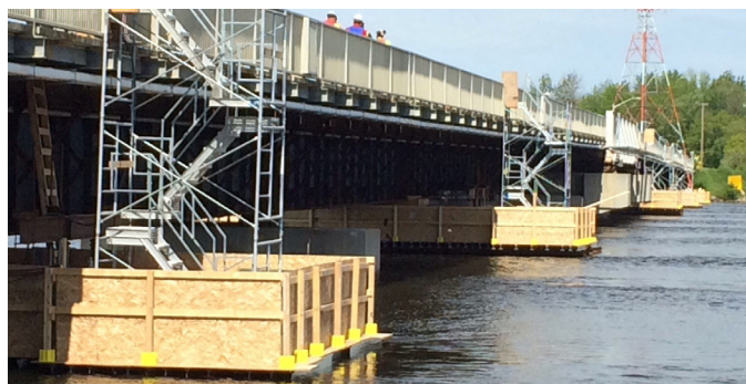
Bridge construction site

www.gov.mb.ca/mit/wcs/constructionproj.html